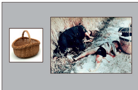
Figure 1. A representative cue–target pair, consisting of a negative scene and a neutral object that resembled an item embedded as a detail in its paired scene. Images are from the International Affective Picture System (Lang et al., 2008) and from Brady et al. (2008). See the online article for the color version of this figure.

Participants' descriptions were scored on three measures. In the identification measure, a description was scored as correct if it included enough detail so that the scene could be identified (based on the measure introduced by Depue et al., 2006). In the detail measure, descriptions were divided into small segments that independently conveyed information, and the absolute number of correct details was counted. Finally, in the gist measure, we defined gist as any element pertaining to the scene's story that could not be changed or excluded without changing the main theme. For each scene, two independent judges determined specific elements necessary to the gist (ranging from two to four per scene, M = 3.10 , SD = 0.69 ), and a description was scored as correct only if it included all necessary elements. The descriptions were scored by two independent coders, both blind to the conditions. Interrater agreement,